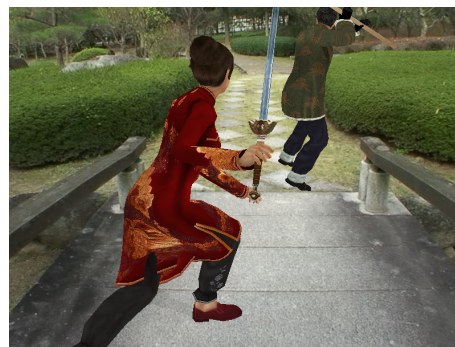
Fig. 1. A pre-visualized scene.

The second one is a pre-visualization method using augmented virtuality [2]. It is designed to work in a real studio